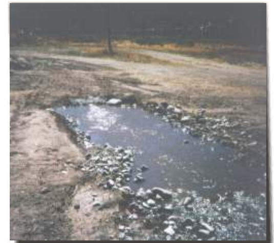
A water piping system was designed to sustain the wetland zone through summer. Here the wetland begins initial flooding.