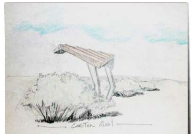
Form as Function. This artistic shade structure represents the form of a native upland bird .