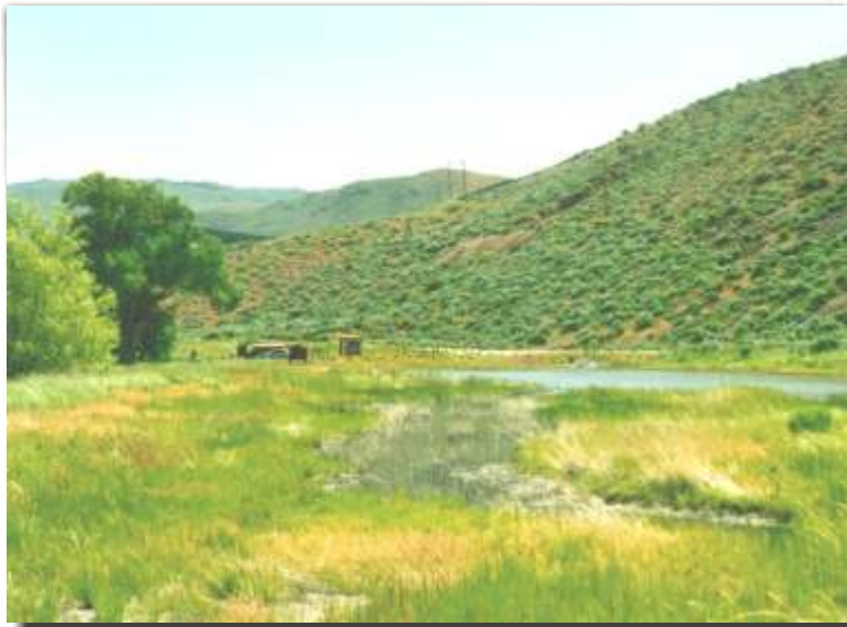
After several seasons a vigorous wetland zone is apparent. This photo can be compared to the one directly above it.