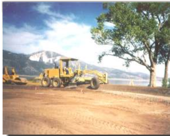
Large equipment implemented the grading plan, which included specific wetland water depths and spot elevations that placed user facilities above historical flood impact.