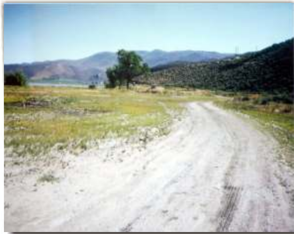
Typical view of vehicle impacted seasonal wetland zone. Working with an inter-disciplinary team the landscape architect developed the design for the site .