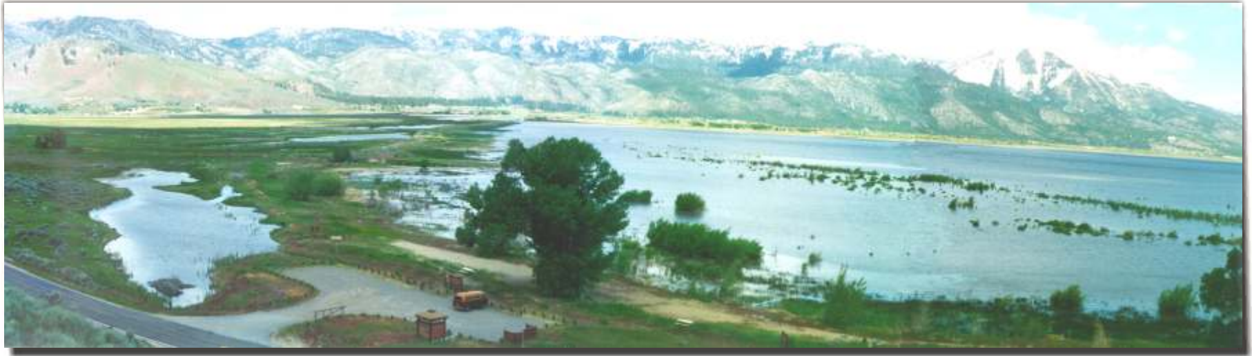
Panorama of the South Beach wetland rehabilitation and Trailhead