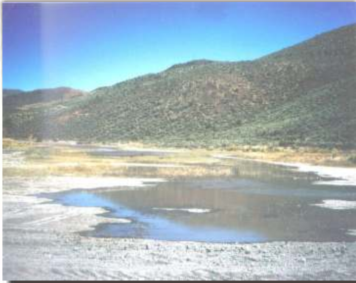
The wetland flooding proceeds, re-wetting the soil for the eventual rejuvenation of plant, wildlife, and scenic resource.