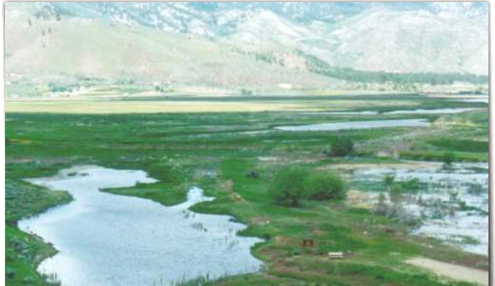
In full Spring growth the wetlands are now viable habitat for birds and mammals. This photo can also be compared to the one above it.