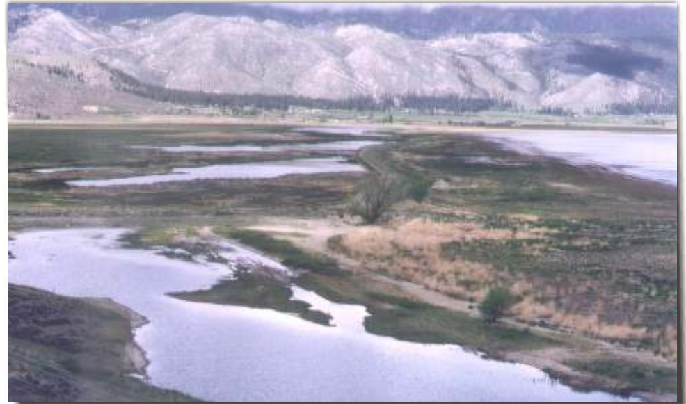
As the wetland zone reaches flood stage the surrounding land is prepared and re-seeded with desirable wetland zone species.